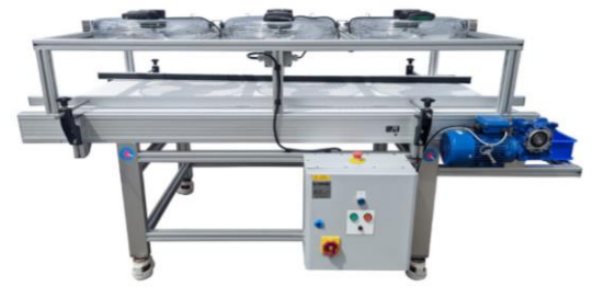
Spreader and Cooler