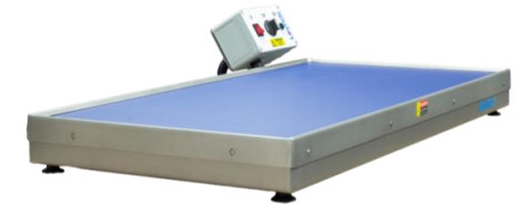
Mini Hot Table