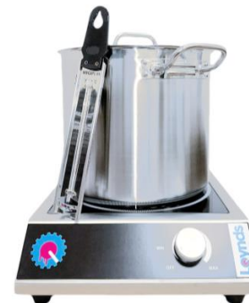
Stove, Pan & Thermometer