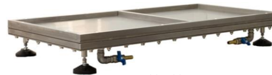
Mini Cold Table