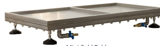
Mini Cold Table