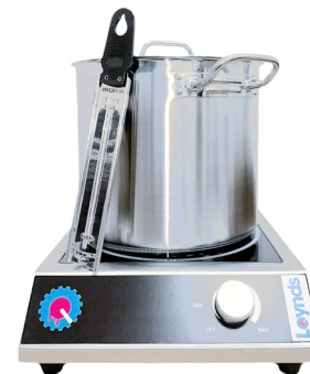
Stove, Pan & Thermometer