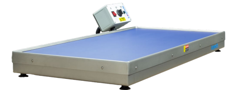
Mini Hot Table