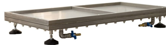
Mini Cold Table