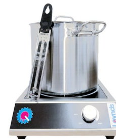
Stove, Pan & Thermometer